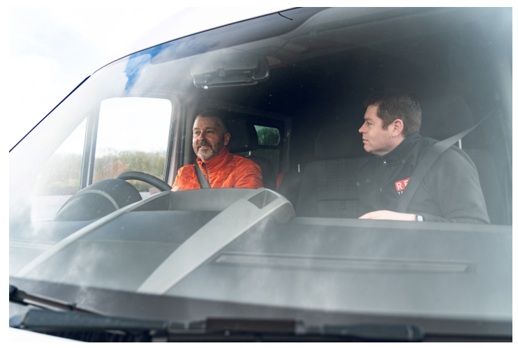
RED Corporate Driver Training update April 2024 - the show time issue!