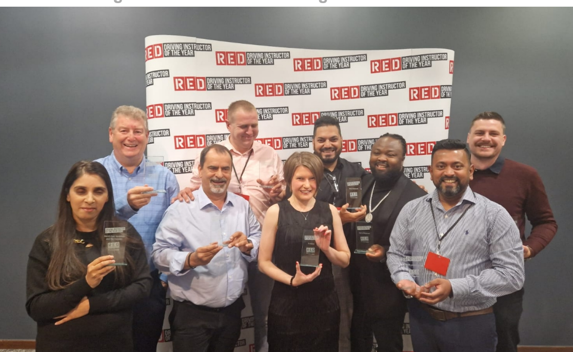
RED Donington hosts the 2023 Driving Instructor of the Year event

"The only way, then, to improve this is to fundamentally improve the skill levels of the person behind the wheel so the incident never happens in the first place. We can get these numbers down – our work with fleets show you can dramatically cut crashes – but it needs everyone to change their mindset so we don't sleepwalk through more years of unnecessary tragedy."