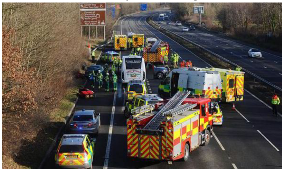
UK Road Deaths & Serious Injuries are flatlining - more to be done

The latest annual road safety statistics - published by the DfT in late September - show improvements in reducing deaths and serious injury in the UK have flatlined.